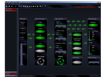
Spotlight on SQL Server Enterprise's Topology view displays at a glance the health of your complete SQL Server environment.